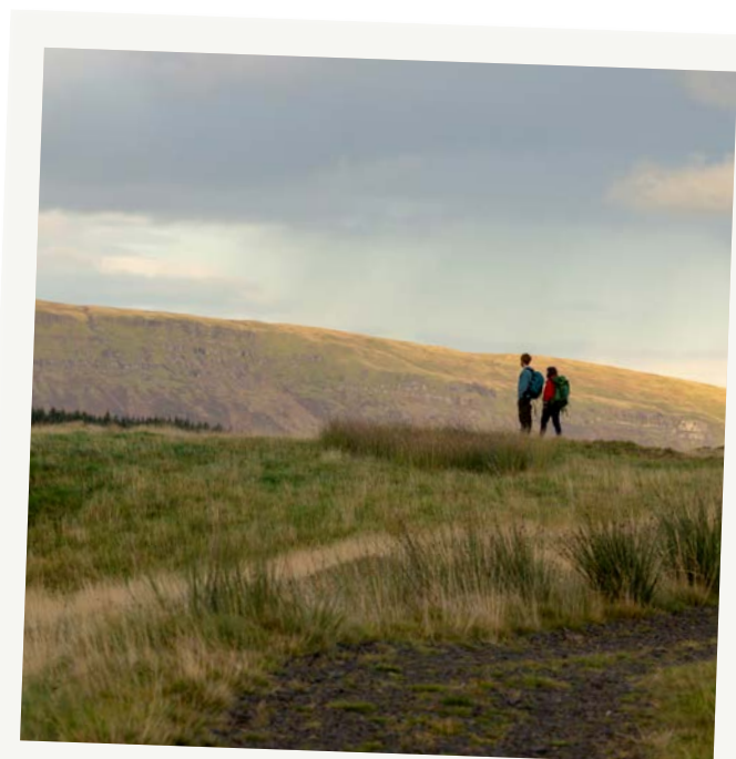
View of the Campsies